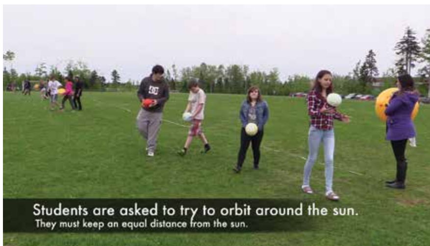
FIGURE 1: Solar system kinulation

The process of developing kinesthetic simulations as explanatory teaching models in your classroom is a relatively simple endeavor and involves the following steps: